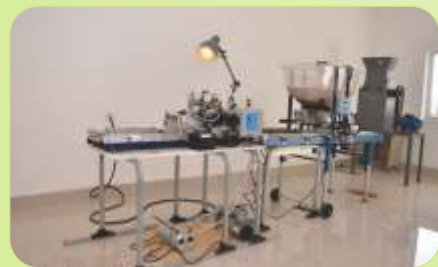
Automatic Seed Liner