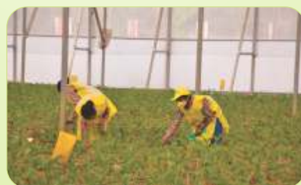
Workers carrying out inter-culture operations in Polyhouse