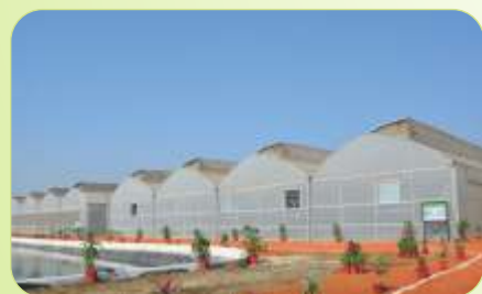
Polyhouses in a Row