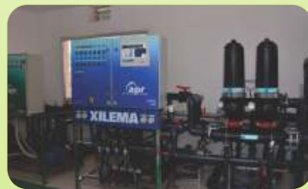
Automatic Fertigation and Filtration Unit