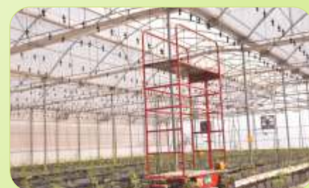
Battery operated Trolley in Polyhouse