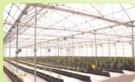
Trellising system in a Polyhouse